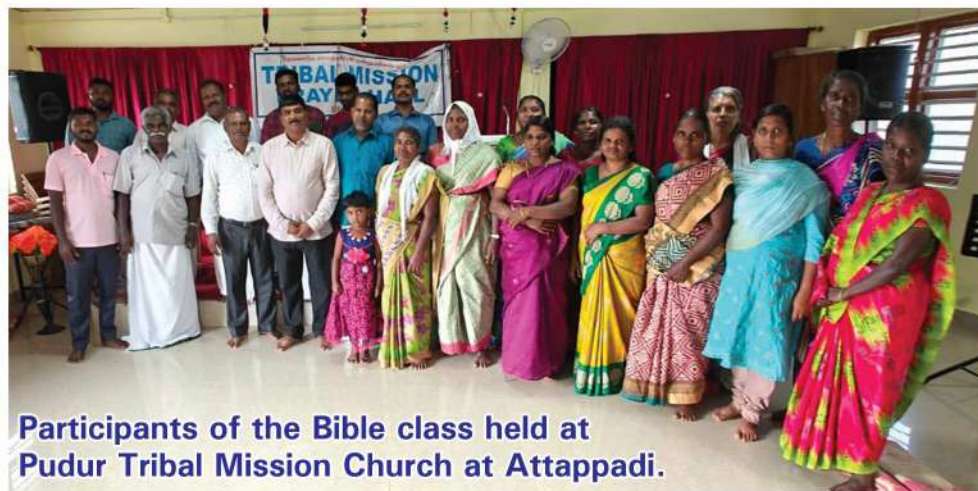
Participants of the Bible class held at Pudur Tribal Mission Church at Attappadi.